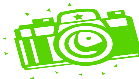
Photo sitting (for yearbook photo and student ID) is free of charge! Picture packages will also be available on these days.

Students who have their picture taken will receive a school photo I.D. card.